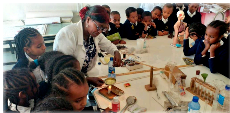
Students in the Self-Stephens Science Lab at the BCI Academy

The Ethiopian Science Museum was opened in October of 2022 and it is impressive in scale and quality. This is sure to be an eye-opening experience for these students and a chance to be exposed to new learning opportunities. We plan to make a day of it and take the students for a meal in Addis Ababa as well. The cost for the transportation, meal and museum admission is $30 USD per student, and we need to include several chaperones. Our funding goal is $600 USD. We're looking for partners to sponsor an A-student at $30 USD to make this academic experience possible.