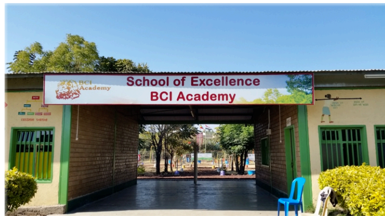
The BCI Academy, a School of Excellence

In an effort to promote excellence in academics, we are introducing the BCI President's Club for 2023. Sponsored students in grades 4-12 who receive an A for the first semester of the 2022-23 school year will be invited on a special academic field trip during the second semester. We anticipate grades to be available in early March, and will learn which students will join at that time. We are targeting the new science museum in the capital city of Addis Ababa as the reward for these students.