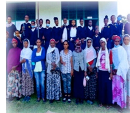
Students with their Guardians