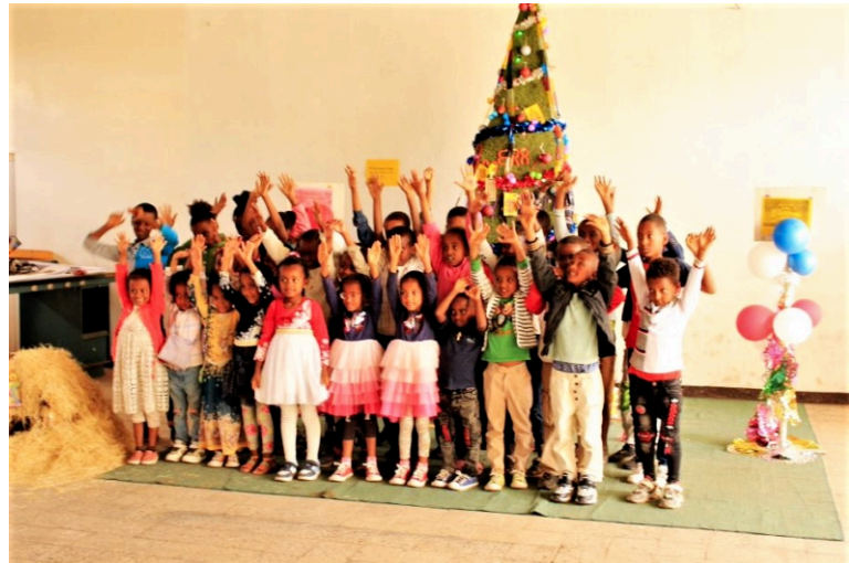
BCI Academy Students Celebrating Christmas