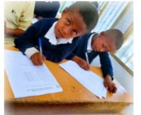
Children Writing Academic Goals