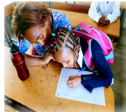
Mother and Child Working Together